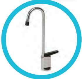
For residential filtration installation use the Glass Filler Kit (98498C).