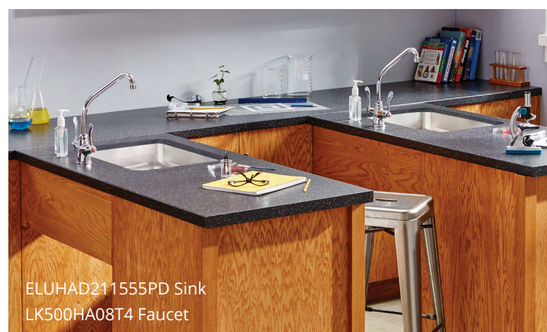
ELUHAD211555PD Sink LK500HA08T4 Faucet

Top: LZOOTL8WSLK Bottle Filler Station & Cooler; Bottom Left: CDKR2517 Sink; Bottom Right: LK4430BF1UEVG Bottle Filler Station